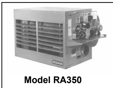
FIGURE 2 - Vertical Louvers for RA/RAD350